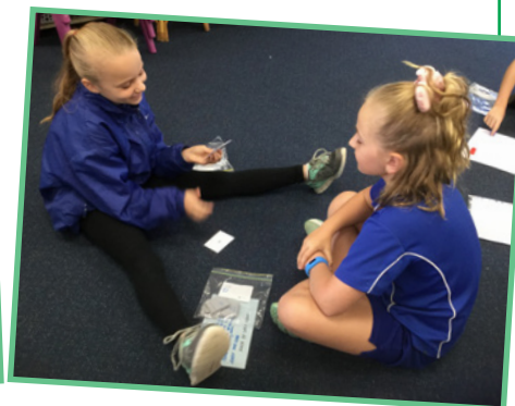
Room 12 students playing Maths Games they made for homework.